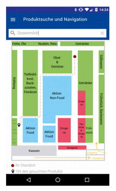
Fig. 4: Product search and in-store navigation

Alternatively, a display of products in the shopping list on a map was considered, including the most efficient paths, but discarded due to the generally small display size of current mobile phones.