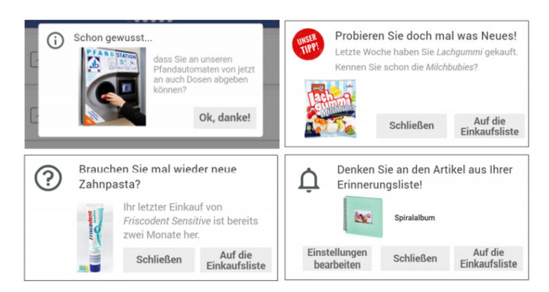
Fig. 5: Product recommendation

Opinions towards push notifications were very different. Some participants felt disturbed by messages for marketing purposes, perceiving them as interrupting. Others appreciated informative messages, reminders, recommendations, and information about short-term discounts. Participants pointed out to the frequency of such notifications being a decisive factor as well as their habitual use of supermarket apps, where they do not expect regular push notifications. Generally, not only advertisements, but also informative messages should be sent (e.g. changed opening times, product information, reviews). Addi-