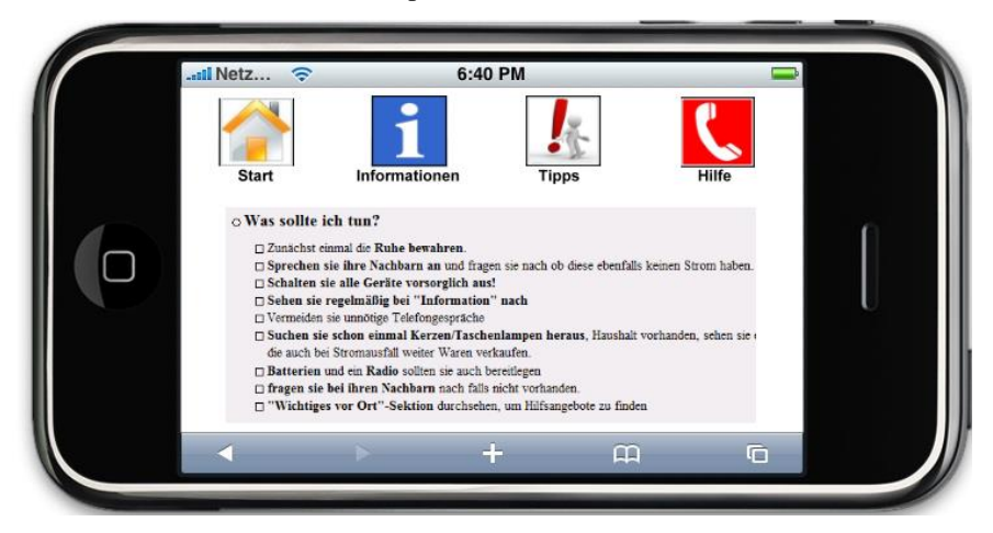
Figure 3: Screenshot of the prototype (in German)

In order to evaluate the concept it was implemented in Java as a clickable prototype, but without access to real time information (figure 3). The figure shows a screen with an