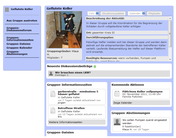
Figure 4: Screenshot of the prototype with groups, activities, tasks and comments (anonymized)

Use of existing social networks: The existence of a social network before the crisis is a condition for the emergence of volunteer groups in the real (Quarantelli, 1984). For virtual volunteers these networks are already established via current social networking services. like Twitter Facebook. or Furthermore they are used as a communication infrastructure, even on-site. A tool for collaboration in crises could theoretically try to create such a network or, even better, make use of existing social networks by establishing connections or building plugins in those social networking services. We decided to develop a prototype connected to Twitter and integrated in Facebook to use existing connections, users and publicity, but isolated from a technical point of view in order to have the data even if the network service is unavailable.